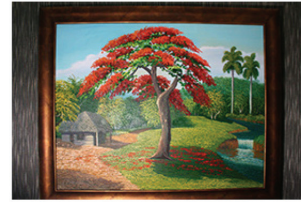
68 Unknown—Cuban Tree Min Bid 700