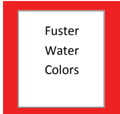
76 Fuster Watercolors Min Bid 50 each