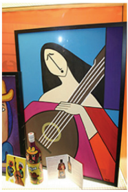
60 Sade—Guitarist Min Bid 800