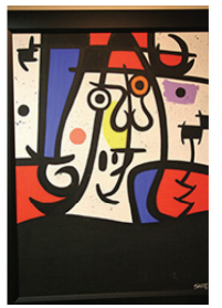
64 Sade—Surprise Min Bid 1200