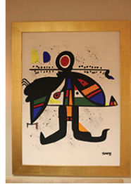
66 Sade—The Stance Private Collection