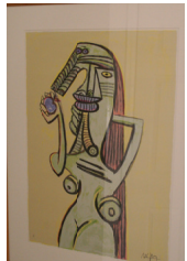
75 Wjion—Forbidden Fruit Min Bid 1500