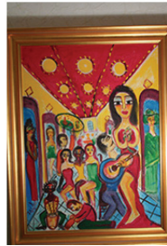
72 Zaide—Serenade Min Bid 1500