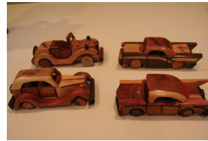
78 Wooden Cars Private Collection