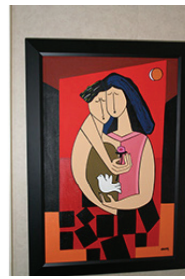
63 Sade—Mother Daughter Private Collection