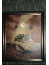
69 Unknown—Moon Hanging Min Bid 700