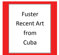
79 Fuster Recent Art from Cuba