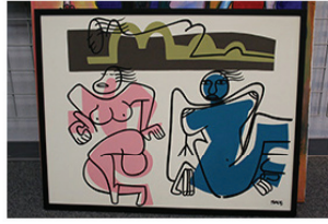
62 Sade—Live Dance Min Bid 600