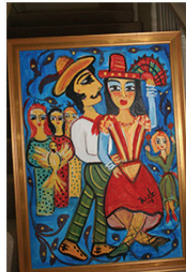
71 Zaide—Love Dance Min Bid 1600