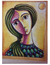
74 Lises—The Eyes Min Bid 1000