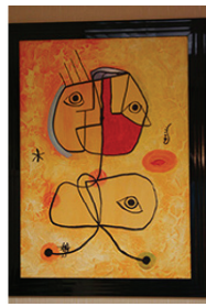
61 Sade—Light Dance Min Bid 500