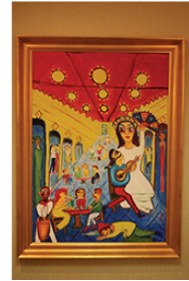
73 Zaide—Wedding Party Private Collection