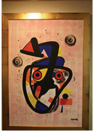
65 Sade—The Eye of Life Min Bid 1500