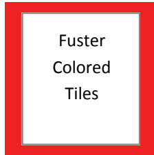
77 Fuster Colored Tiles Min Bid 200 each