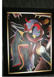
67 Unknown—Abstract Woman Min Bid 500